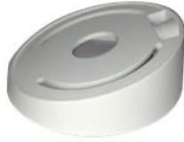
Inclined ceiling mount